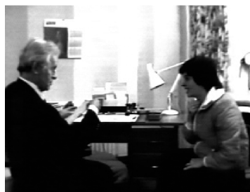
i(h)t's. i(h)t's I