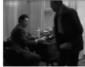
↓ Oooh: there