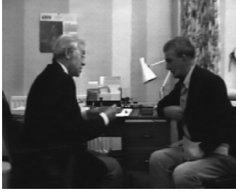
↓ better come back