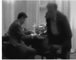
↓ °hhtha(h)nk y(hh)ou