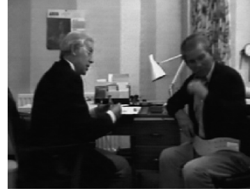
↓ khhhhhhhhh hhh