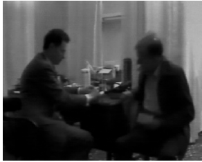
↓ Thank you very much