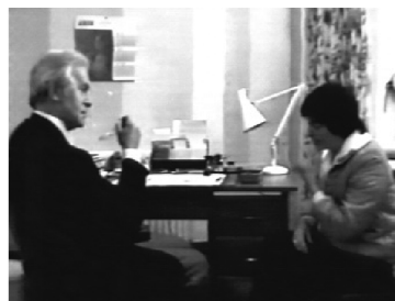
managed to be sick